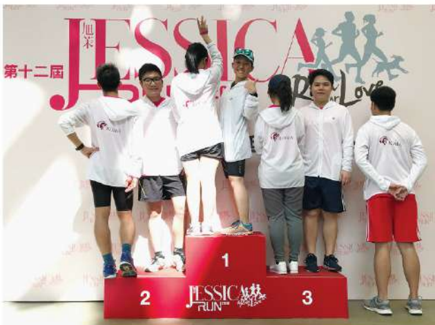
Seven Roma colleagues participated in "旭莱 Jessica Run" and had fun

Roma firmly believes that our community will become better, with contributions from every one of us!