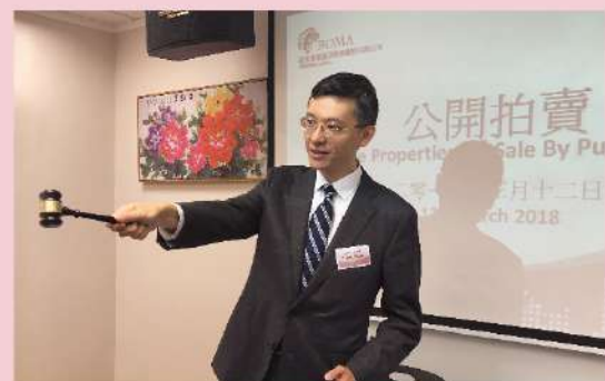
Property auction held in March 2018

We believe this business model is worth to explore further.