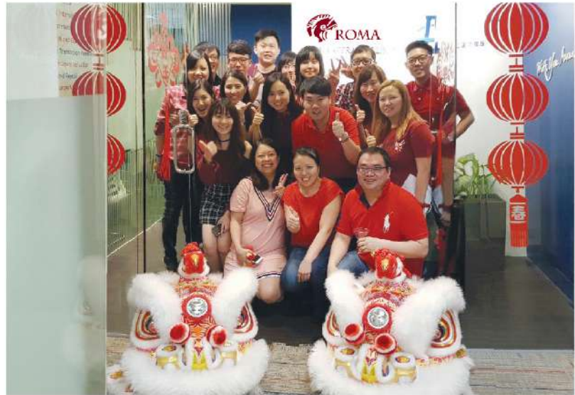
Chinese New Year at the office of OA International Holdings

In February 2018, to celebrate Chinese New Year, our business partner OA International Holdings had an authentic celebration party in Singapore: paste up Spring Festival couplets, dragon dance, traditional Chinese food, and of course red packets. The office was full of Chinese vibes and colleagues' laughter.