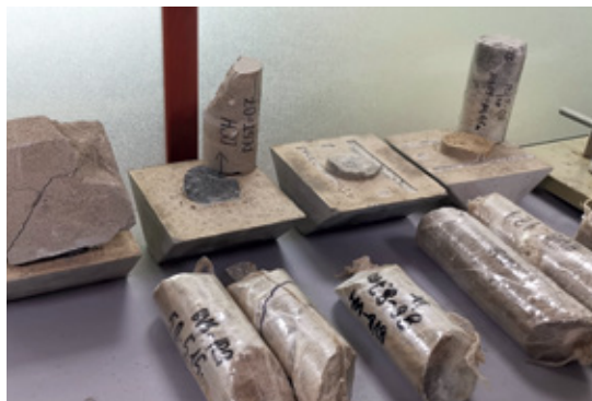
Drill core sample preparation for geotechnical experiment in the laboratory.

ROMA had been engaged by Erdene Resource Development Corporation (TSX:ERD) as the overall project manager to coordinate a consortium of International and Mongolian consultants to deliver the Feasibility Study NI 43-101 Technical Report for the Mongolia Bayan Khundii Gold Project in southwest Mongolia. This report presents the next phase of the project's development with an updated mine design study, FEED for the processing plant and associated infrastructure, a hydrogeological study, detailed waste management plans, and an updated economic model.