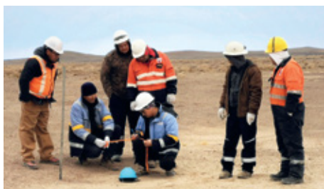
Erdene geologists and Falcon drilling team are confirming drillhole collar position.

In addition to the role of overarching advisor of the team, ROMA had also taken several roles including the lead on-site supervisor for the latest geotechnical drilling and the advisor of geotechnical, hydrological, cost estimation and financial analytics. The Report had been successfully lodged with Toronto Stock Exchange and ROMA is proud to have walked with Erdene on this big step ahead.